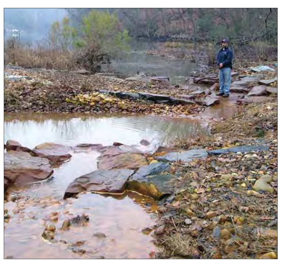
The good, the bad, and the ugly. Riverkeeper Drew Koslow stands near a stormwater pipe responsible for blowing out tons of sediment (above, top). Two approaches to handling such sediment: an expensive creek restoration (right) and a cheaper method that Koslow calls "old school," simply emptying a pipe into a pool surrounded by rip-rap (above, bottom).

rew Koslow shouts from the center of a deep ditch, the sides of which rise well above his head. "We call this 'Gingerville Gorge,' " he yells. The ditch was once a small streambed, but water erupting through a large culvert pipe has eroded a deep gully, with banks some 10 feet high. Where has all the dirt gone that used to be here? Into Gingerville Creek, says Koslow, and then the South River, just south of Annapolis.