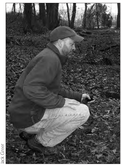
Rebuilding what we've lost , restoring a stream requires a new kind of engineering, with careful attention to soil chemistry as well as water flow.