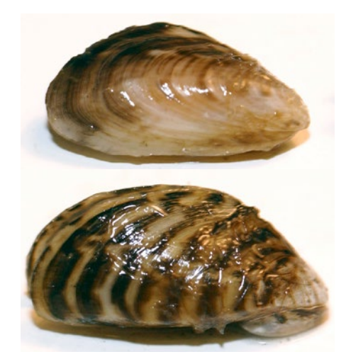
Quagga mussels (top), and zebra mussels look and behave so similarly that they are often misidentified. But unlike zebras, quaggas can inhabit soft sediment, not just hard surfaces. And while quaggas are slower to establish, they become dominant over time in most water bodies. See bit.ly/invasive-mussels for more about the differences between zebra and quagga mussels .

In August, the county created a task force to assess how best to eradicate the mussels—a science that continues to evolve as stakeholders manage established and new outbreaks worldwide. They consulted resource managers who had stopped mussel invasions elsewhere, including Millbrook Quarry in Virginia, the first open-waterbody eradication of its kind. Also a popular quarry among