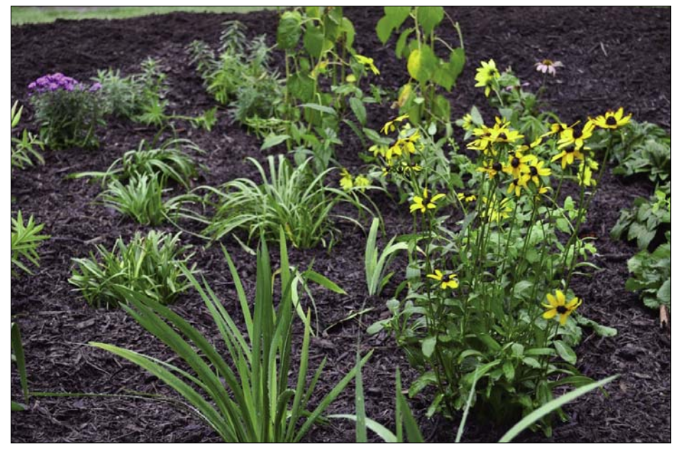
Rain gardens may look scraggly when they're first installed, but within a season, the flowers, shrubs, and grasses planted inside may grow to fill every nook and cranny. Planted in suburban lawns and elsewhere, they could play an important role in improving water quality miles away in the Chesapeake Bay.

by the Metropolitan Washington Council of Governments to help clean up the then heavily polluted Anacostia River. Today, he directs the Chesapeake Stormwater Network, a professional organization for those who specialize in managing urban stormwater.