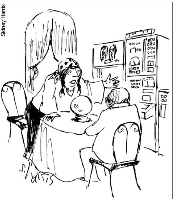
"How do you want it—the crystal mumbo-jumbo or statistical probability?"