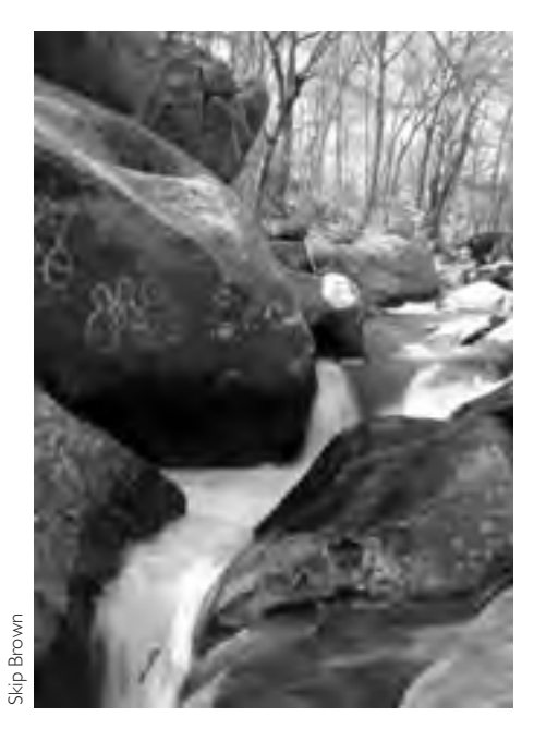
Bubbling between the fall line's enduring rocks, spring-time waters of the Northwest Branch rush downstream toward the mainstem Anacostia. As noted by scientists and conservationists alike, restoring the river will require efforts in the streams of suburban Maryland, as well as downstream in the tidal waters of Washington, D.C.